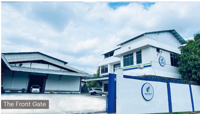
The Front Gate