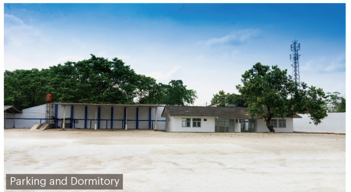
Parking and Dormitory